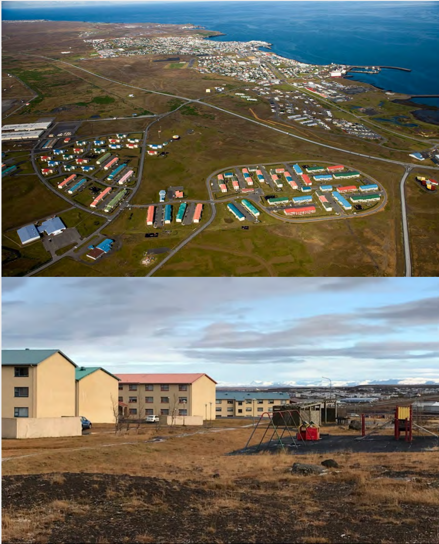
Ásbrú in Reykjanesbær.