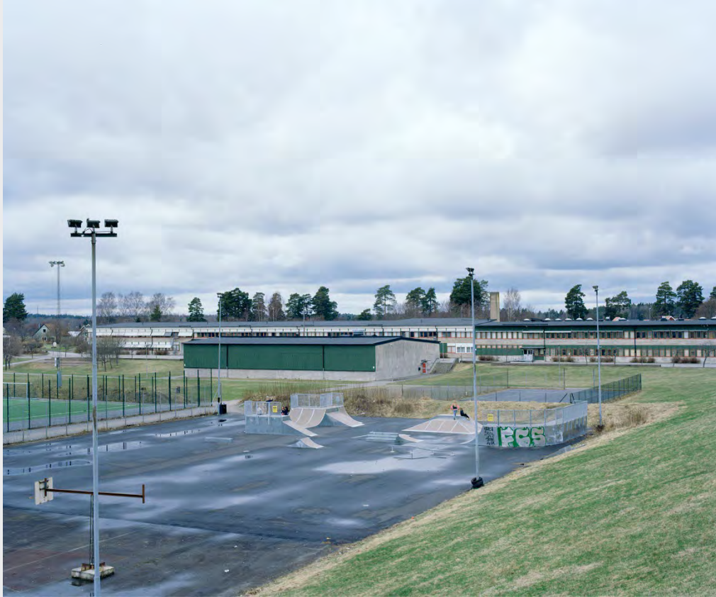
Place where plans for modules for newly arrived refugees in Haninge were halted.