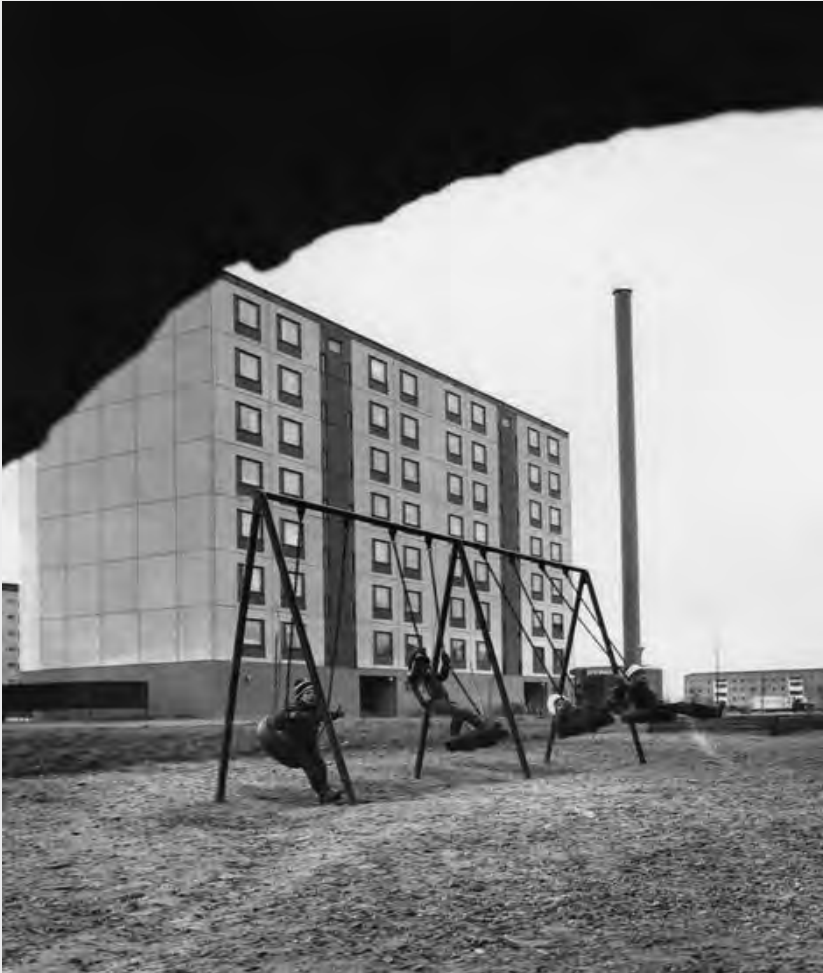
Pormestarinluoto, in Pori, pictured in 1973.